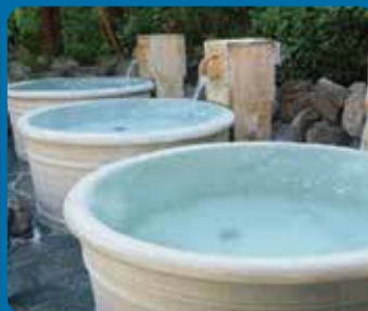
Pot bath (x3)