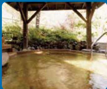
Hot spring (free-flowing)

Here at NANIWANOUYU we use a natural hot spring (Natrium chloride hydrogen carbonate spring) deriving an extraordinarily high quantity of water from 659m underground. It is called "Beauty Spa" as it makes the skin smooth and silky. The water in this natural spring is mildly stimulating, making it perfect for people of all ages - from infants to elderly.